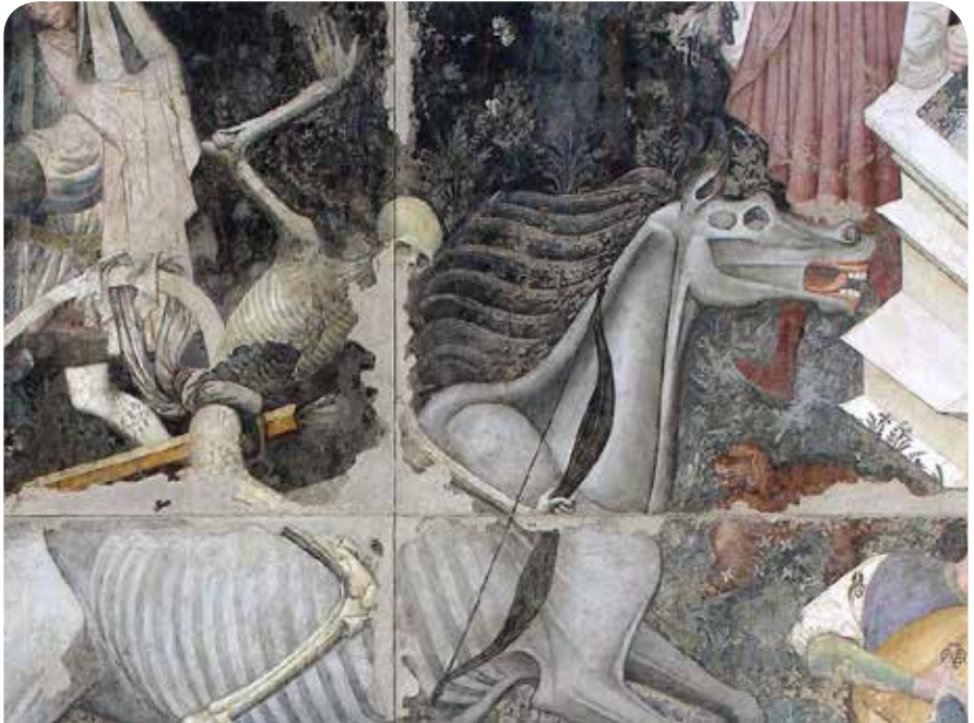
8 The Triumph of Death, Palermo, Galleria Regionale della Sicilia di Palazzo Abatellis, detail

references to the international late gothic period, in which Burgundian-Provençal elements flowed within a series of markings of Catalan painting. To date, there are only partial comparisons to be made; and that can be considered emblematic of a cultural passage between two eras. Dated back to the forties of the century, the fresco could be reflected in its time in murals that no longer exist, apparently showing Stories of San Bernardino , in the chapel of La Grua Talamanca united with the church of the monastery of Santa Maria di Gesù of the Observant Franciscans, just outside of Palermo. Experts of the late 19 th century, including Cavalcaselle and Bernard Berenson, who saw the remains, recognised the frescoes in relation with the Triumph of Death . The already severely damaged