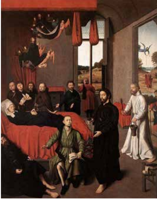
36 Petrus Christus, Death of the Virgin, San Diego, California, Putnam Foundation Timken Museum of Art