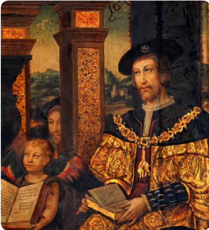
3 Male figure like Charles V with collar of the Golden Fleece, detail of La disputa di San Tommaso, Palermo, Galleria Regionale della Sicilia [Sicily's Regional Gallery] in Palazzo Abatellis

bloomed in the century's different cultural areas: urban planning, architecture, painting, sculpture and decorative arts, in a continuous dialogue: centre/outskirts , between Palermo and its area.