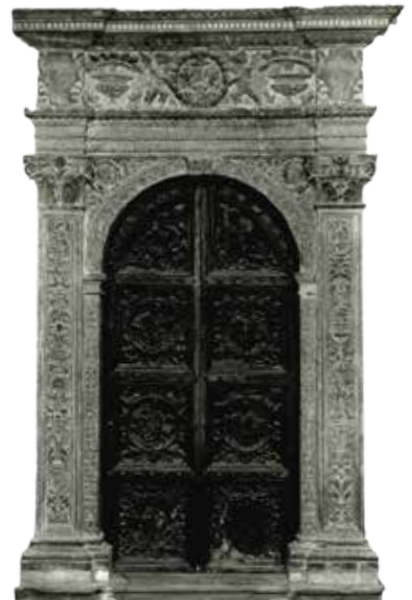
37 Gate, Palermo, complex of the Trinità la Magione