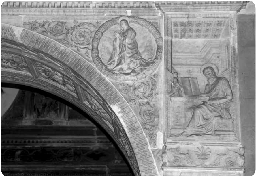
21 Francesco Laurana with Pietro de Bonitate , Arch of the Chapel Mastrantonio, Palermo, Church of San Francesco d'Assisi, detail