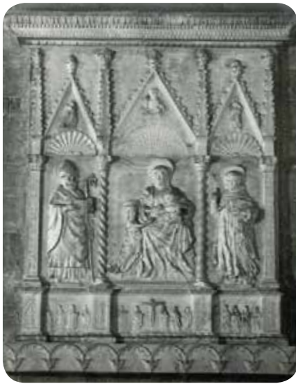
15 Mystic Marriage of St. Catherine of Alexandria and Saints, Palermo , Church della Trinità la Magione